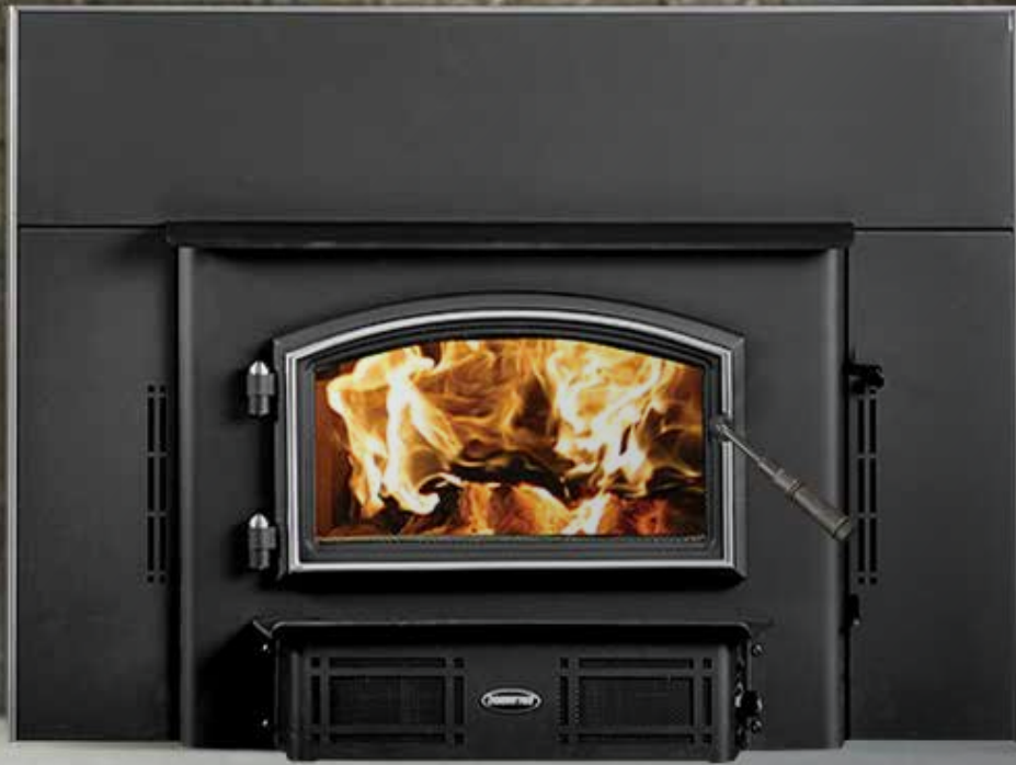
2700 INSERT WITH METAL SURROUND AND SATIN NICKEL TRIM KIT, AND SATIN NICKEL ARCHED DOOR