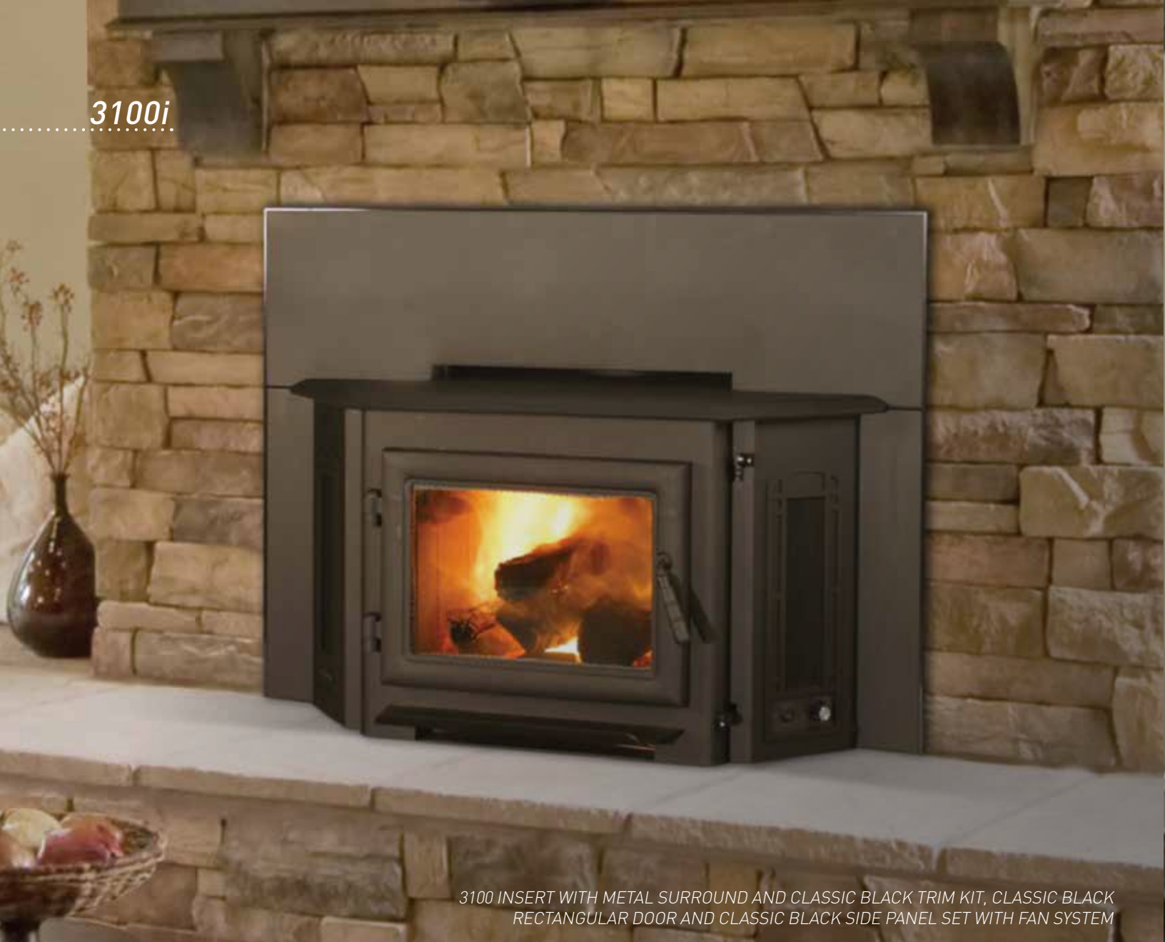
3100 INSERT WITH METAL SURROUND AND CLASSIC BLACK TRIM KIT, CLASSIC BLACK RECTANGULAR DOOR AND CLASSIC BLACK SIDE PANEL SET WITH FAN SYSTEM