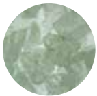
CRYSTAL GLASS (STANDARD)