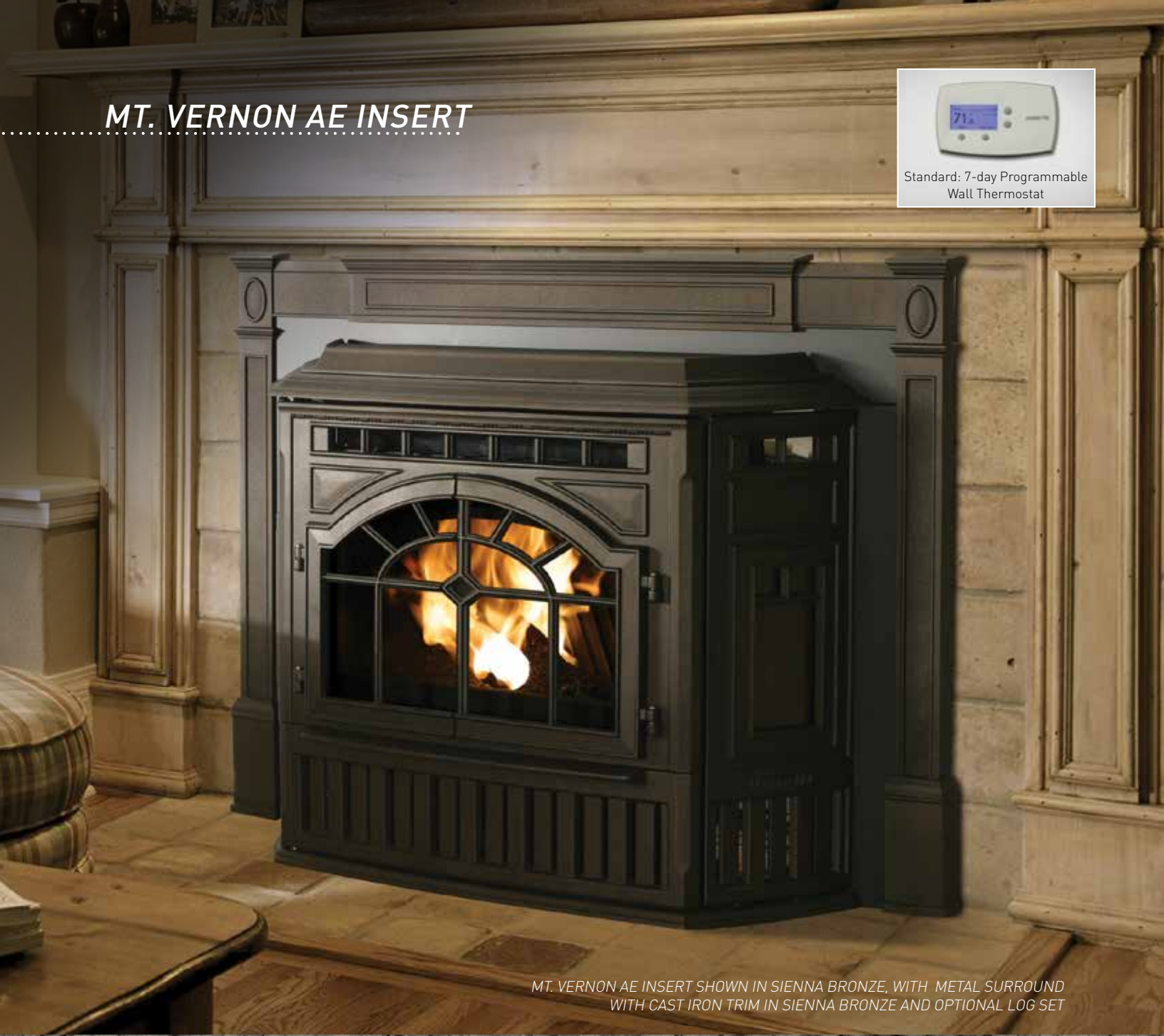
MT. VERNON AE INSERT SHOWN IN SIENNA BRONZE, WITH METAL SURROUND WITH CAST IRON TRIM IN SIENNA BRONZE AND OPTIONAL LOG SET