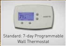
Standard: 7-day Programmable Wall Thermostat