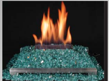
20" DF SS Chassis with Blue/Green Glass