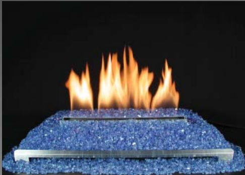
30" SS Chassis with Cobalt Blue Glass