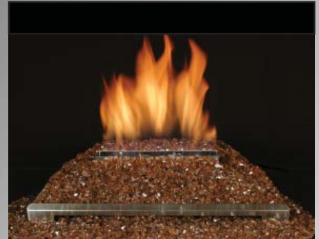
20" SS Chassis with Copper Glass