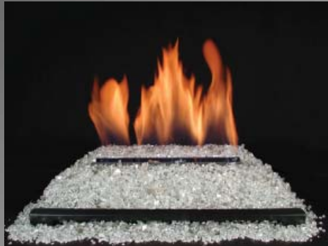
24" Black Chassis with Platinum Glass