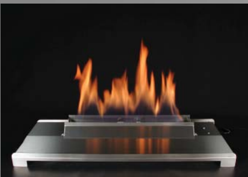
30" DF SS Chassis - no Glass