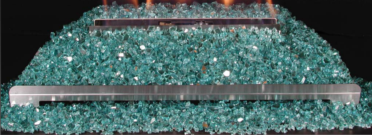
24" Stainless Steel Chassis with Blue/Green Glass