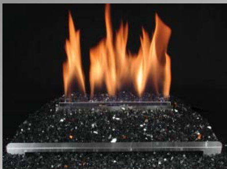
24" SS Chassis with Black Glass