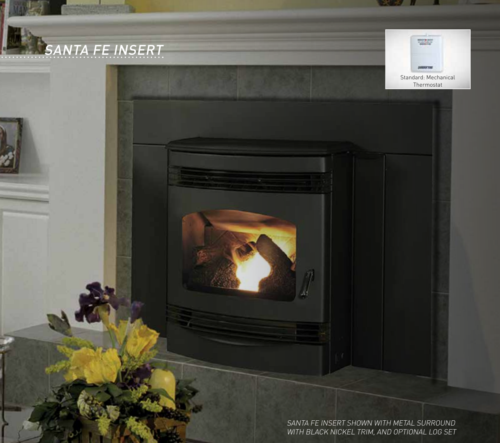
SANTA FE INSERT SHOWN WITH METAL SURROUND WITH BLACK NICKEL TRIM, AND OPTIONAL LOG SET