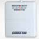
Standard: Mechanical Thermostat