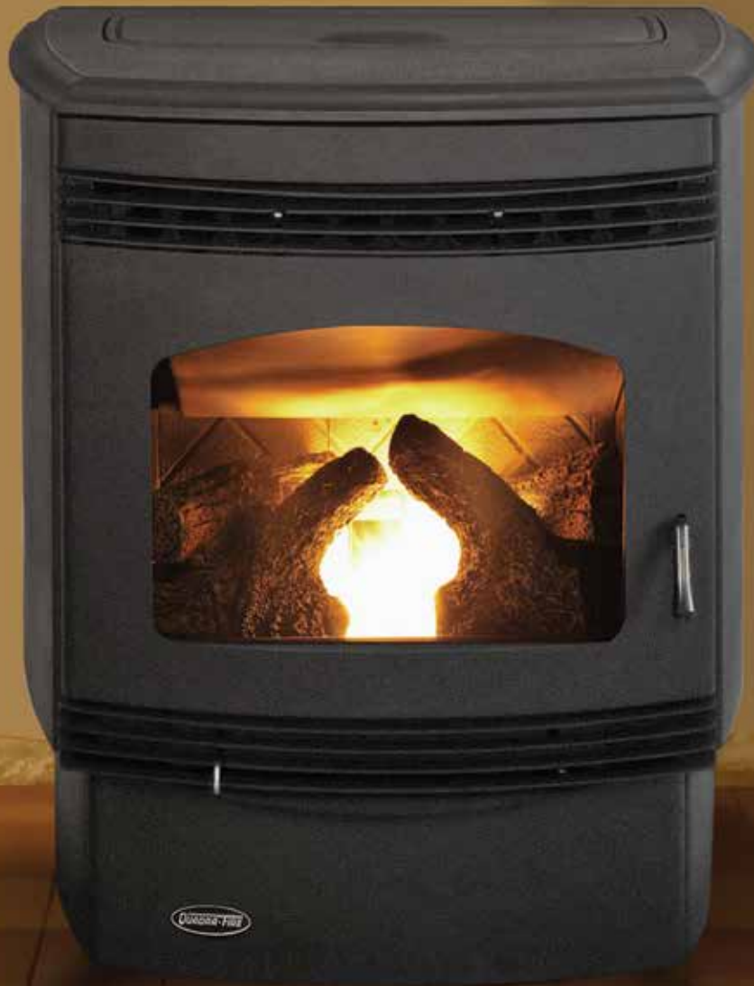
SANTA FE SHOWN WITH BLACK GRILLE AND OPTIONAL LOG SET