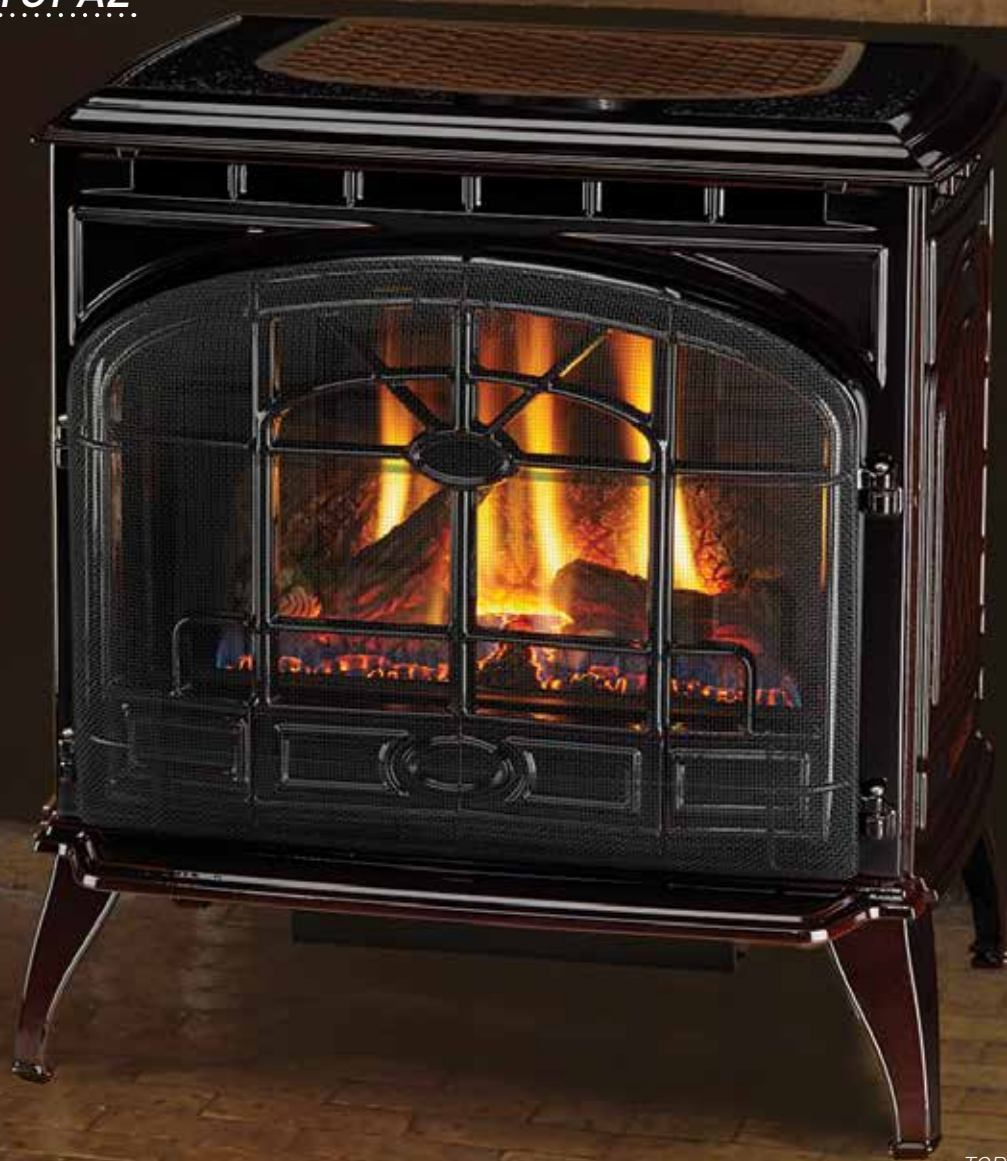
TOPAZ SHOWN WITH QUARTET FRONT IN MAHOGANY WITH REAR VENT KIT AND STANDARD SAFETY SCREEN