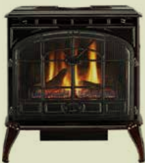
TOPAZ » QUARTET FRONT