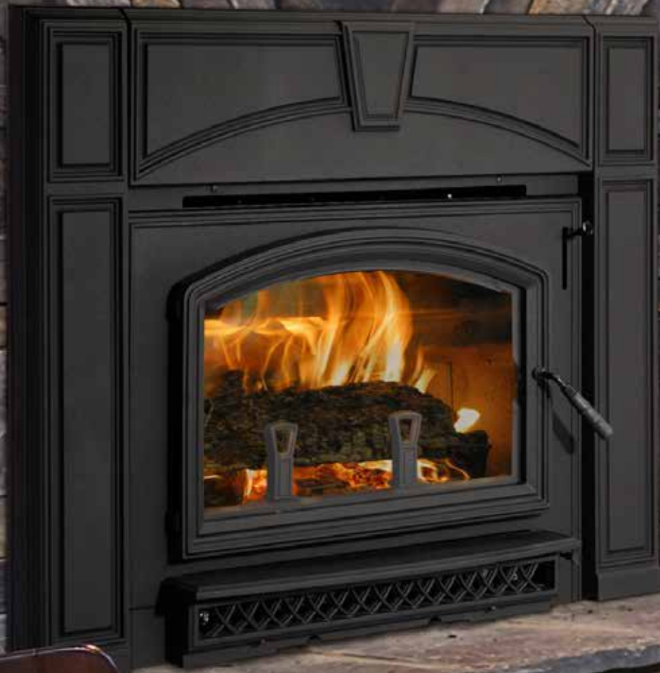
VOYAGEUR GRAND INSERT IN CLASSIC BLACK WITH CLASSIC BLACK CAST IRON SURROUND